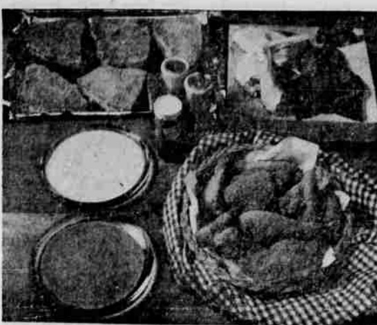
DEAR TO MEMORIES—Chicken-fried steak is dear to memories of many old-timers. Others are equally nostalgic about crisp herb-fried chicken. Here we do both, using evaporated milk and packaged corn flake crumb coating that really clings, producing a crisp, golden finish.