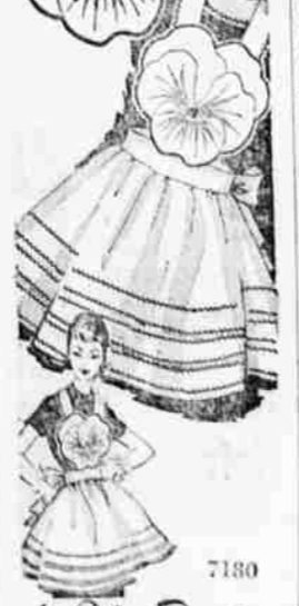
Pansies are favorites! This one, forming a big bib, will be a colorful protection. Make a bib or half apron. Small pussy makes pocket on skirt. Rick-rack, binding add color. Pattern 7180; transfer printed pattern; directions.