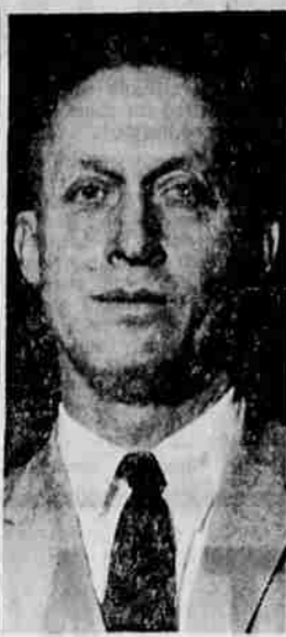
MAN OF YEAR - Bill Bowerman, above, ex-Medford High athlete and coach, was named Man of the Year in Oregon sports at the annual Bill Hayward Banquet of Champions at Portland on Monday night. Bowerman is now the internationally known coach of the University of Oregon track team. His Ducks won the National Collegiate Athletic association crown last June.