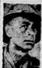
By Lynn W. Watkins (Register & Tribune Syndicate, 1963)