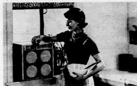
Cook in cool comfort is the idea behind this General Electric unit. It fits a single pane of glass without blocking light or view, has four rotating air directors.