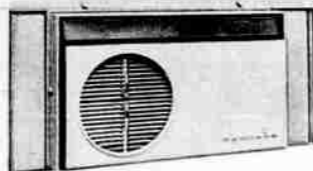
This Fedders' unit sports a weather wheel, which enables air to flow in any two directions, and an air cushion that reduces operating sound.