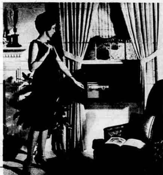
From Westinghouse comes furniture-cabinet styling in four décors. The traditional model shown fits snugly over the unit, allows cool air to be emitted at top, nips drafts.