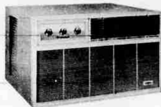
Whirlpool built a comfort-guard control into its room units, designed to reduce overchilling and help balance room temperature.