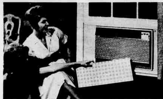
Decorate at whim with the removable front panel of this Chrysler Airtemp unit. Pushed flush against the unit's top and sides, panel becomes a weather seal in winter.

This is National Electrical Week, a fine opportunity to discover