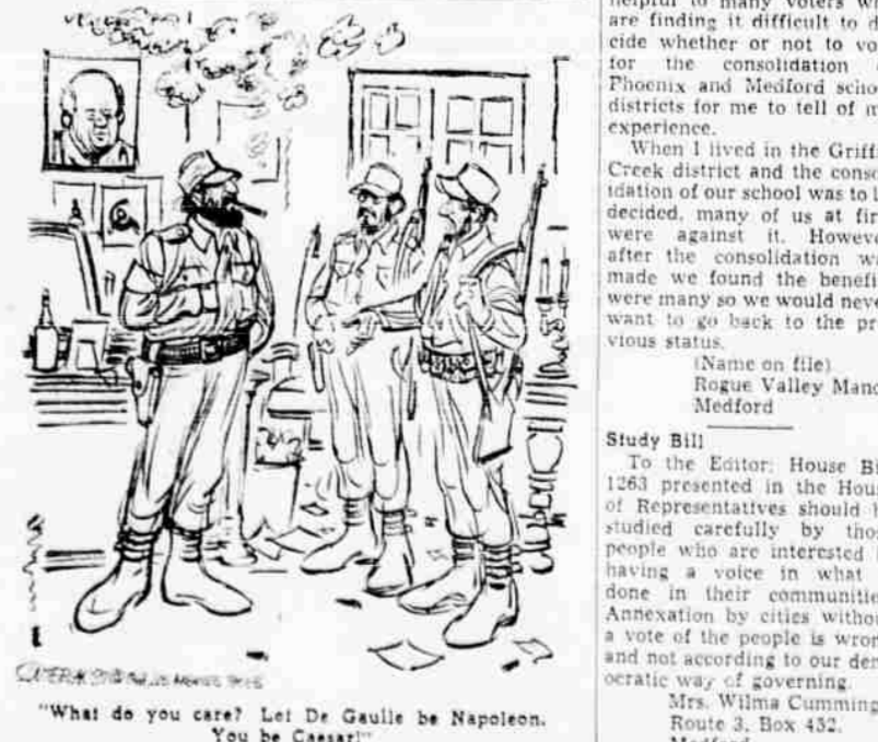
"What do you care? Let De Gaulle be Napoleon. You be Caesar!"