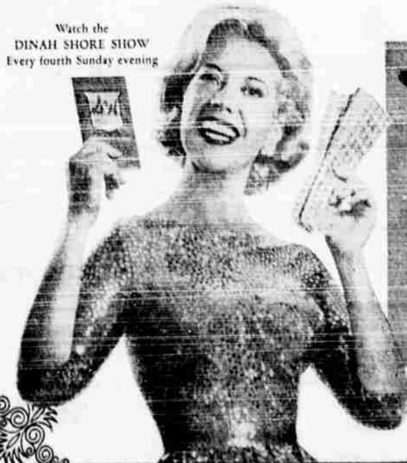
Watch the DINAH SHORE SHOW Every fourth Sunday evening

Dinah Shore says: Shop at all the fine stores and service stations that give S&H Green Stamps... America's Most Valuable Stamps