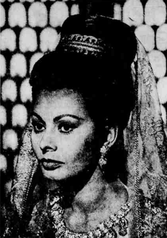
Madrid, Spain—Last year it was the Cleopatra hair-do. The 1963 version deserts Egypt and embraces Rome. Here is Sophia Loren, as a Roman princess, her black tresses styled in the old-new Patrician look inspired by her role in Sam Bronston's "Fall of the Roman Empire," being filmed here.