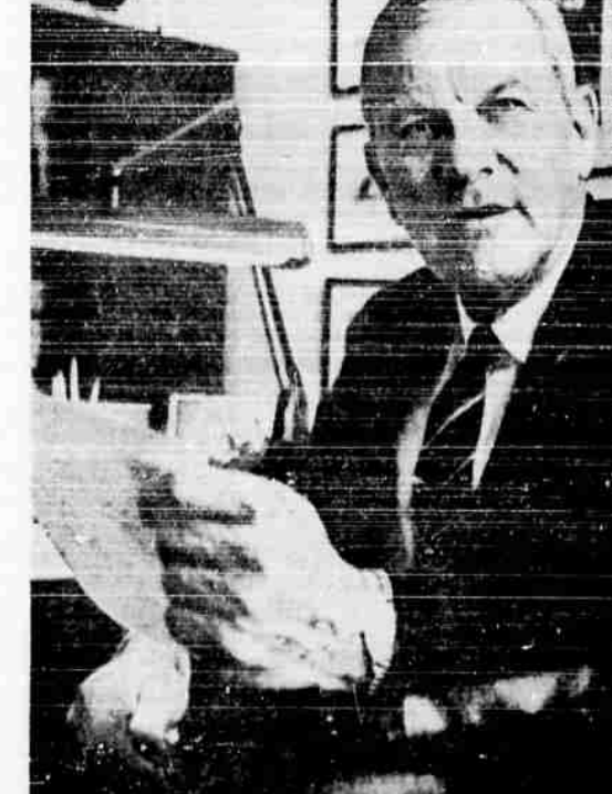
NAMED CHAIRMAN - Rep. Porter Hardy Jr. (D-Va.) is shown in his office at the Capitol in Washington after he was named by the House Armed Services Committee to be the new chairman of its special investigations group. He replaces Rep. F. Edward Hebert (D-La.).