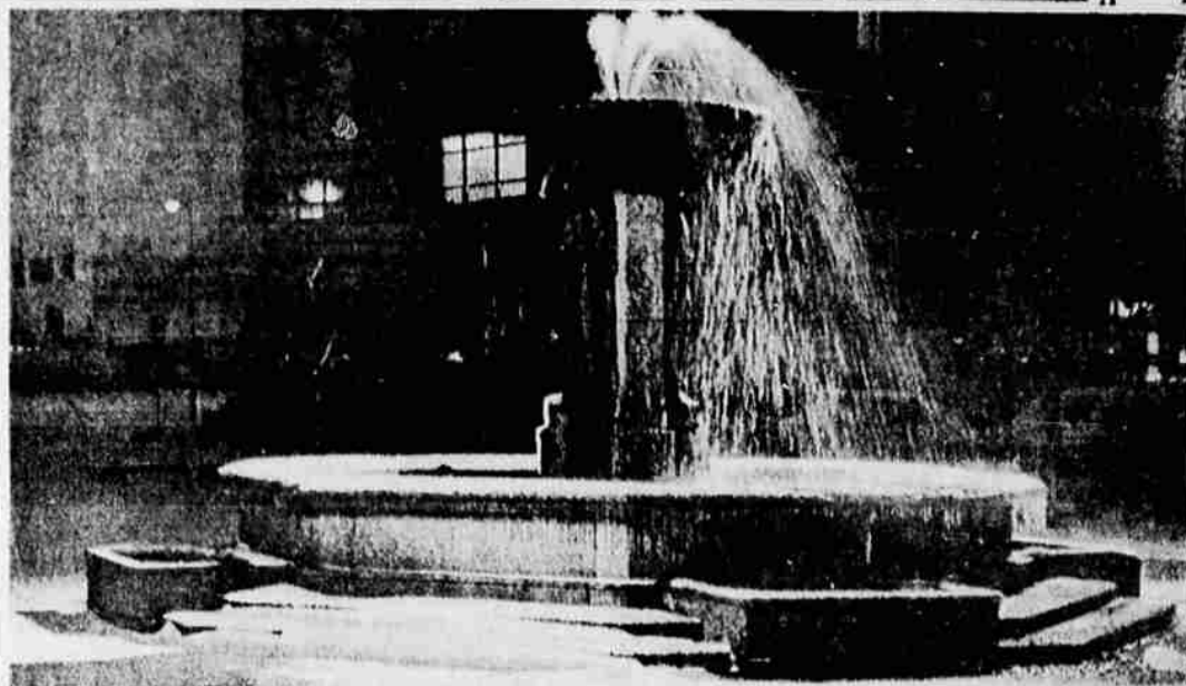
COLD FOUNTAIN - Snow, winds and low temperatures combine to make this icy picture of the Skidmore Fountain in downtown Portland. Snow on the streets reflected

Subscribers - To report improper or non-delivery of the Mail Tribune in Medford, phone 772-1111, Ashland 411 at 816 Bridge st., or phone 482-2002, Yreka, phone Yreka 2438 before 6:45 p.m. daily and 10:30 a.m. Sundays. If regular delivery arrives shortly after 7:00 call please notify office, this eliminates special messenger service.