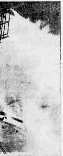
SYSTEM TESTED—A huge spray rig produces a vapor cloud over a hovering Boeing Vertol 107 helicopter as the sub-freezing Ottawa, Canada, weather produces ice on the rotor blades to test the de-icing system of the new aircraft.