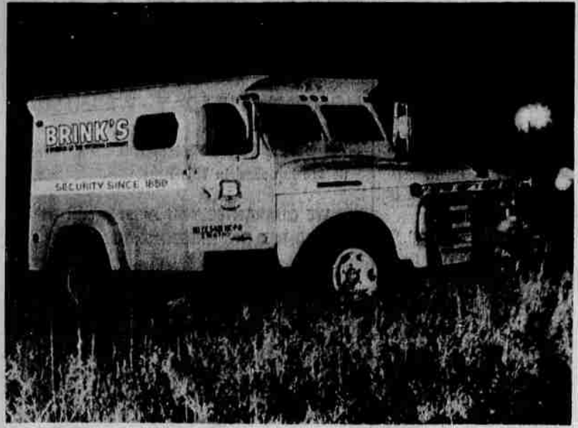
HI-JACKED TRUCK —Brink's Co. armored truck is shown in the brickyard where it was taken after being hi-jacked by a gang of masked gunmen near suburban Des Plaines. F. Neuberger, one of the two Brink's guards, was found handcuffed in the backseat of the truck. The gang escaped with $250,000.

The quick, bloodless success indicated months of preparations and rehearsals, they said.