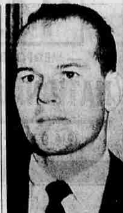
DR. SAM SHEPPARD Clemency Requested