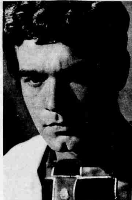
Boyd won fame in "Ben-Hur," but he's equally good as a song-and-dance man in new "Jumbo."