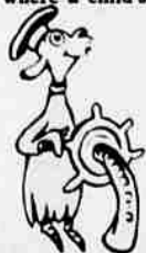
Illustrations © 1968, 1960 Dr. Seuss

Canadian residents please mail coupon to Beginning Readers' Program, A Div. of The Guller Group Ltd., 2547 Danforth Ave., Toronto 13, Ont. M2C