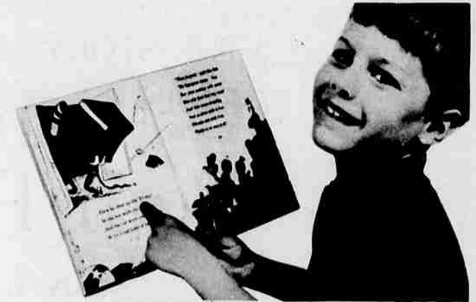
"The Cat in the Hat" © 1967 Dr. Seuss

Most books written simply enough for first, second and third graders necessarily be dull? It was always assumed so... until the beloved DR. SEUSS created "The Cat in the Hat." The kids loved it, and parents and teachers were thrilled to see their children reading joyously and unaided. Now the idea has been expanded by Dr. Seuss and other gifted writers and artists into a whole program of irresistible BEGINNER BOOKS.