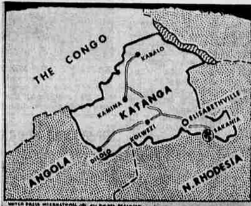
OCCUPY SAKANIA—United Nations forces Saturday occupied the former Katanga stronghold at Sakania, 110 miles south of Elisabethville and only four miles from the Northern Rhodesian border, without resistance, the UN command announced.

Basketball Scores Saturday College Results: Stanford 86, Oregon St. 69; Idaho 91, Oregon 58; Southern Oregon 80, OCE 57.