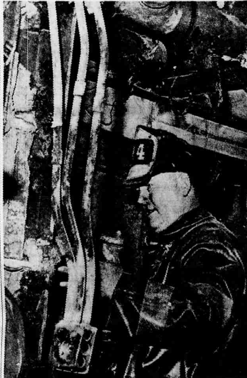
FIRE IN INSULATION - A firemen inspects pipes in the pipe shaft on the 31st floor of the Empire State Building in New York Wednesday by a series of similar blazes in after a blaze broke out in pipe insulation the pipe shaft. (UPI)

Haworth informed the commission that the recent flood caused an estimated $1,500 in damage to city parks. He said however, that department crews have completed restoring the parks to their original condition.