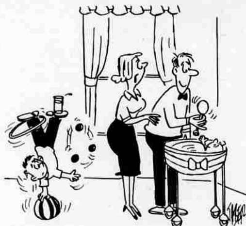
"I think we're paying too much attention to the baby."

Candettes with 2 antibiotics EASE SORENESS DOUBLY FAST