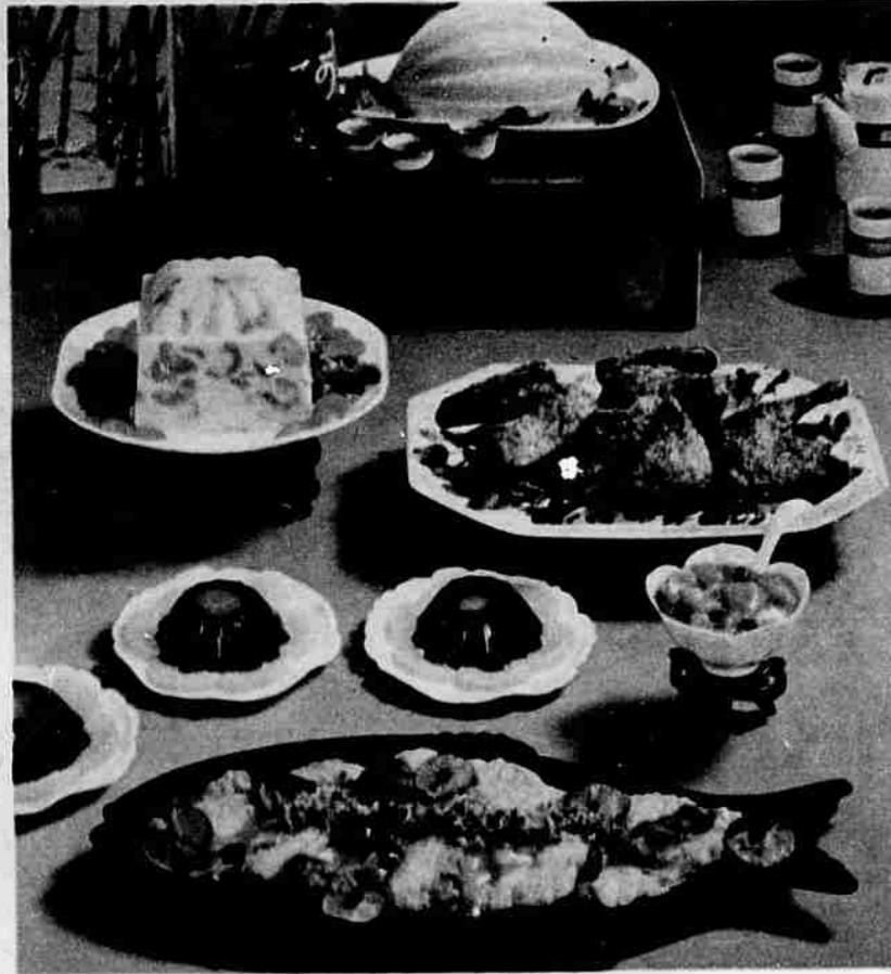
Creations accentuating the tantalizing flavors of Japan (from top, clockwise): Ocha-Coconut Mousse, Duckling à la Gourmet with Sauce Orientale, Fish in Coconut-Mushroom Sauce, White Peach Dessert, and Creamy Mandarin Orange Salad.