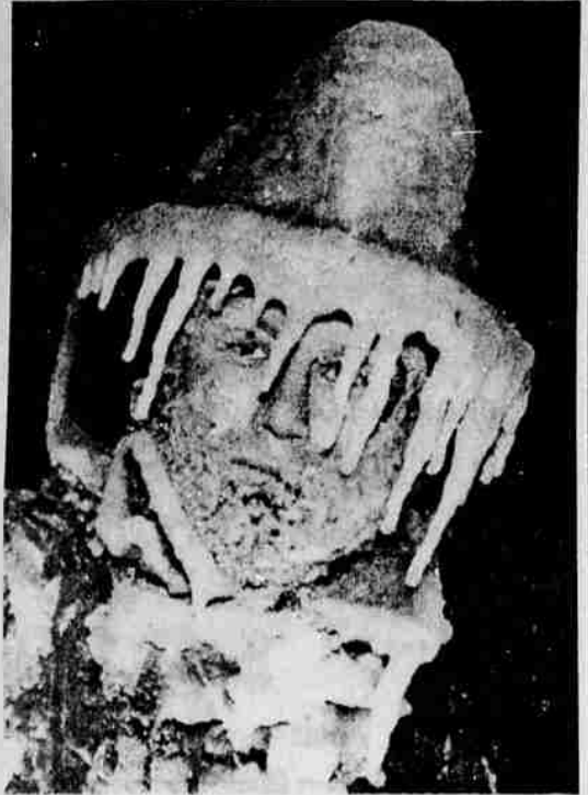
ICY AFTERMATH—A fireman is covered with ice after battling a fire at a lumber yard in Providence, R.I., in sub-zero weather.