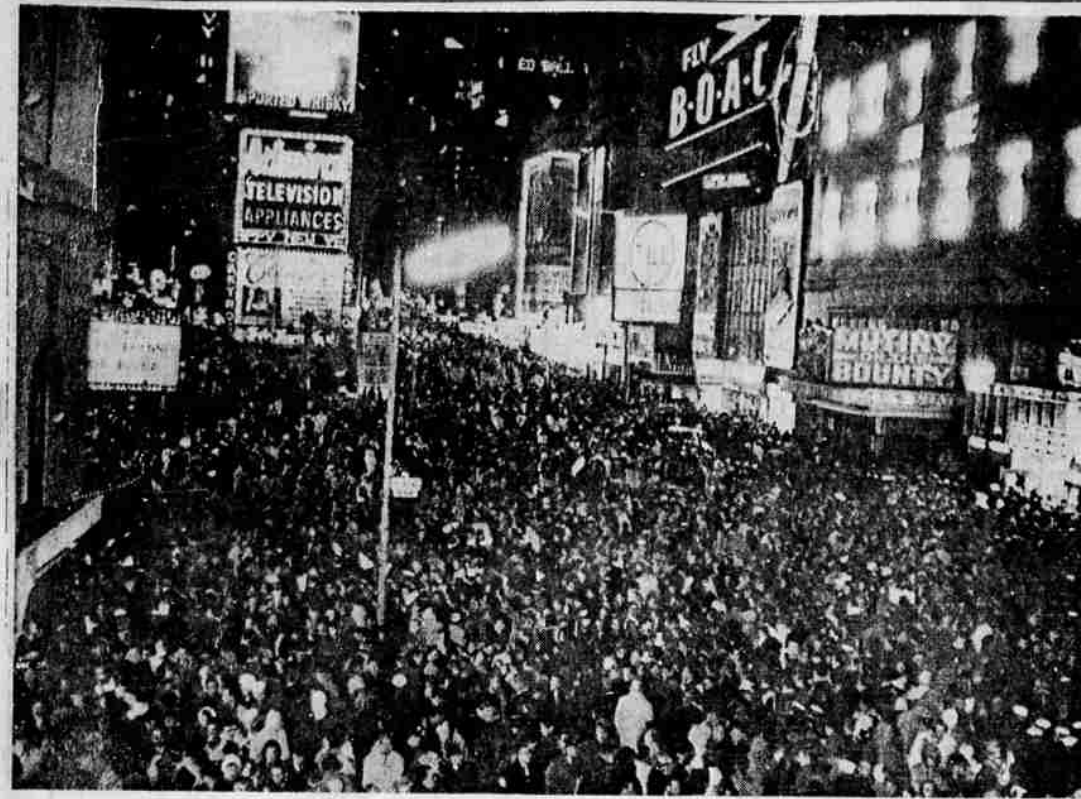
TRADITIONAL WELCOME —Despite the frigid weather crowds throng New York's Times Square to welcome the new year in traditional style. Police described the New Year's Eve crowds as "the smallest and coldest in years".

18 Pages Two Sections MEDFORD, OREGON, TUESDAY, JANUARY 1, 1963 No. 244