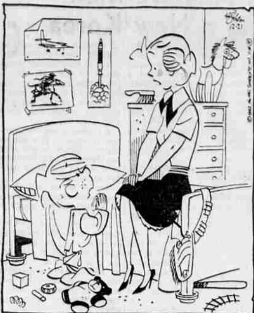
"I DIDN'T MEAN TO ASK FOR NEW ROLLER SKATES, BUT SOMETIMES I GET HIM MIXED UP WITH SANTA CLAUS."