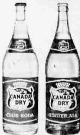
Purest in the world, stays fresh and lively longer! Blends perfectly in smooth the taste of the spirit used!

Remember: 4/5 of your drink IS the mixer! To multiply drinking satisfaction, mix with the 'special sparkle' of Canada Dry.