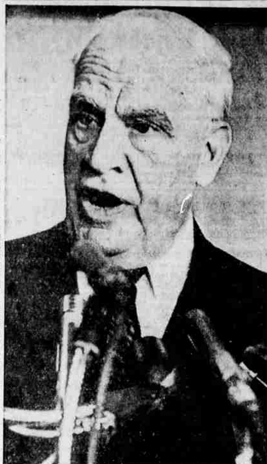
GNP PREDICTION —Commerce Secretary Luther Hodges predicts the nation's Gross National Product will hit about $534 billion this year, representing an increase of more than 7 per cent over 1961. He is shown as he told a news conference that while the increase in economic activity was encouraging, "the pace is not satisfactory."