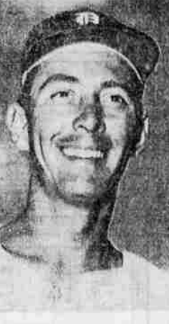
OUTSTANDING — Southpaw Hank Aguirre of the Detroit Tigers was officially certified today as the American league's outstanding pitcher of 1962.