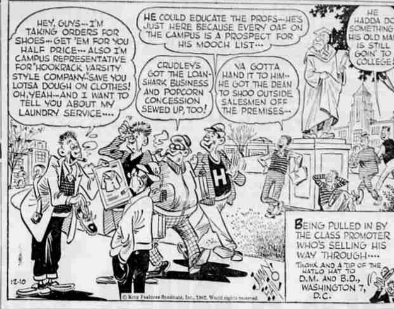
BEING PULLED IN BY THE CLASS PROMOTER WHO'S SELLING HIS WAY THROUGH...