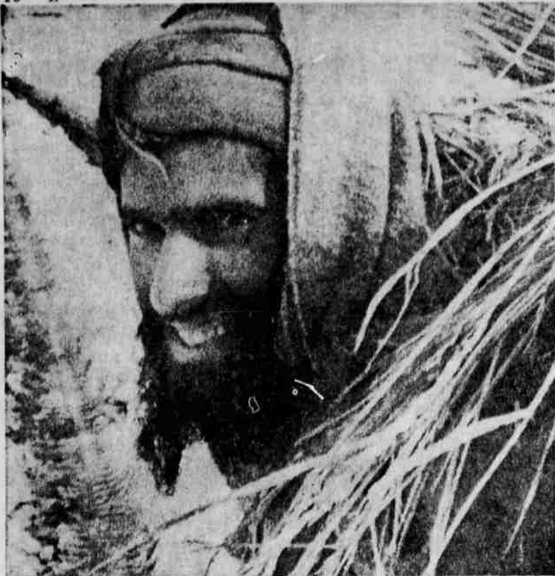
CHEERFUL SOLDIER - With a blanket wrapped around his head, an Indian soldier appears cheerful despite being stationed in the snow-covered Ladakh region of Kashmir. Harsh weather is another "war" India must fight in her battle with Communist China.