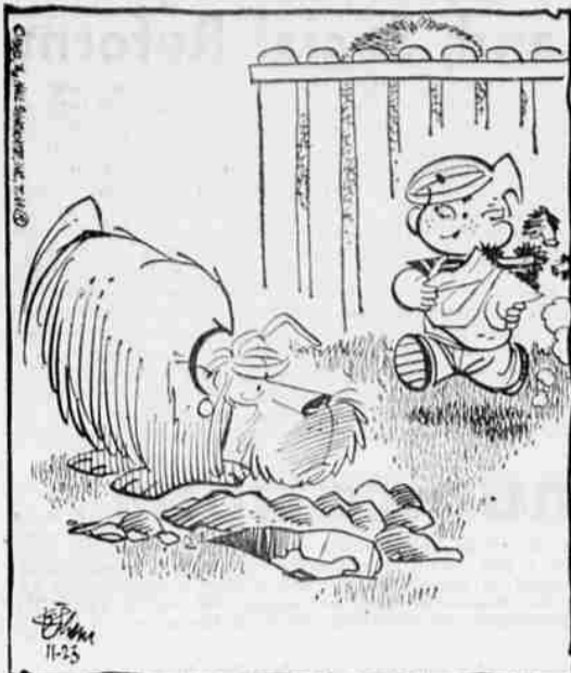
"BEFORE YA COVER UP THAT BONE LETS THROW THIS BROCCOLI IN THERE!"