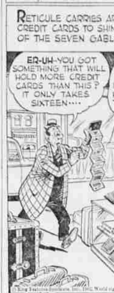
ER-UH-YOU GOT SOMETHING THAT WILL HOLD MORE CREDIT CARDS THAN THIS? IT ONLY TAKES SIXTEEN....