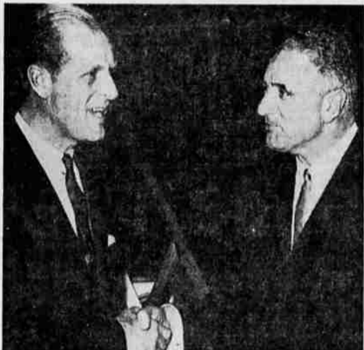
OFFICIAL GREETING — Prince Phillip of Great Britain is shown on arrival at San Francisco International Airport where he was greeted by Mayor George Christopher, right. The prince, who was greeted by about 300 persons, plans to be in the area for a week. His visit coincides with "London Week" in San Francisco. (UPI)

SPY SAID CAPTURED IN CUBA Havana, Cuba — (UPI) — Premier Fidel Castro's government claimed today it captured a Cuban it described as the U. S. Central Intelligence Agency's "principal agent" in Cuba before he could sabotage the country's copper and nickel mining industry.