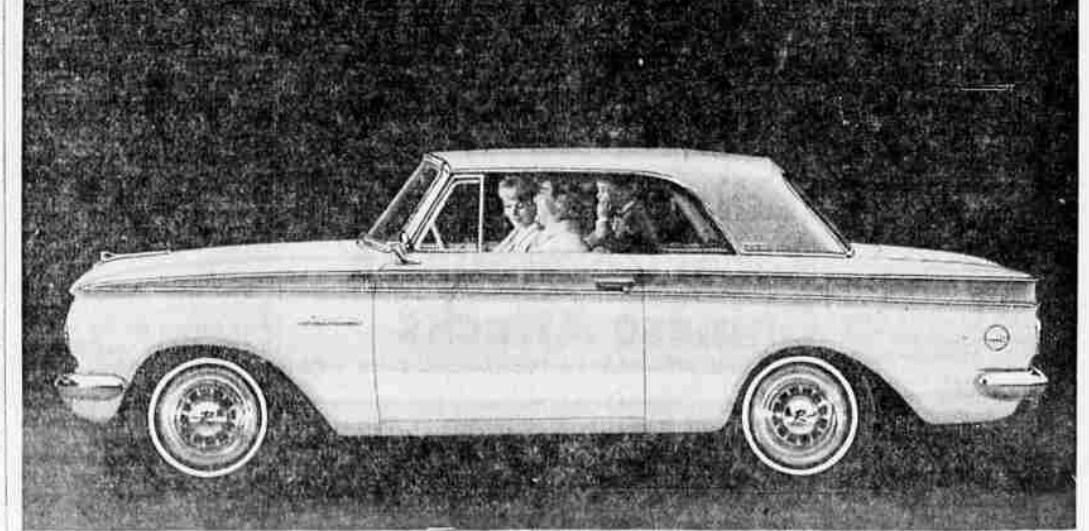
All-new 1963 Rambler American 440-H hardtop. Bucket seats, console standard.

FOR '63...THE ECONOMY KING HAS BRAND-NEW ZING