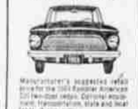
*Manufacturer's suggested retail price for the 1963 Rambler American 440-H hardtop, bucket seats, console, transmission, radio and heat seats. 4-cyl. engine.

Rambler prices still start at $1846 America's Lowest Price