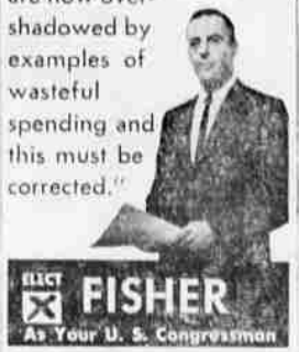
SELECT FISHER As Your U. S. Congressman

"I would support a cut in foreign aid because of indicators that tell of waste in the program. I fully recognize both the human needs and the requirements of the State Department... but greater care must be taken in the spending of money that is appropriated. The successful aspects of foreign aid are now overshadowed by examples of wasteful spending and this must be corrected."