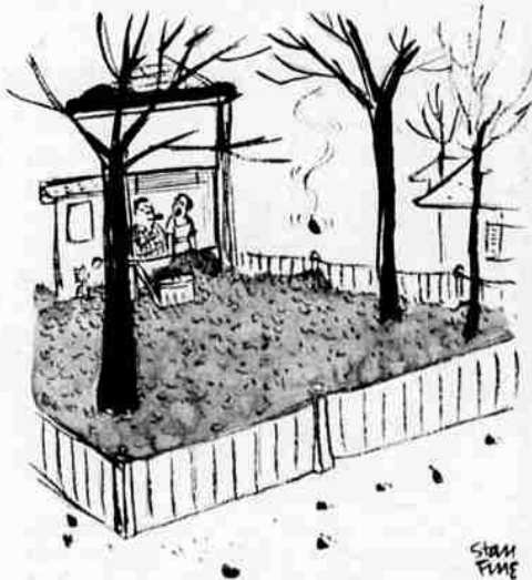
"There goes the last one. Now will you start raking?"