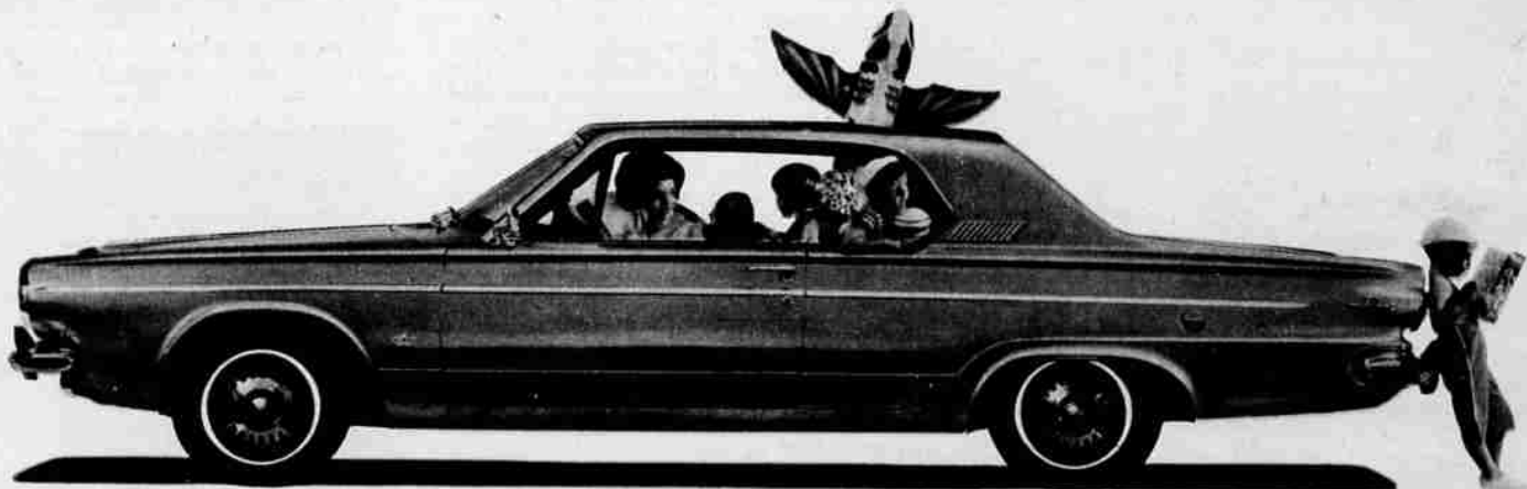
DODGE DART ALMOST FULL