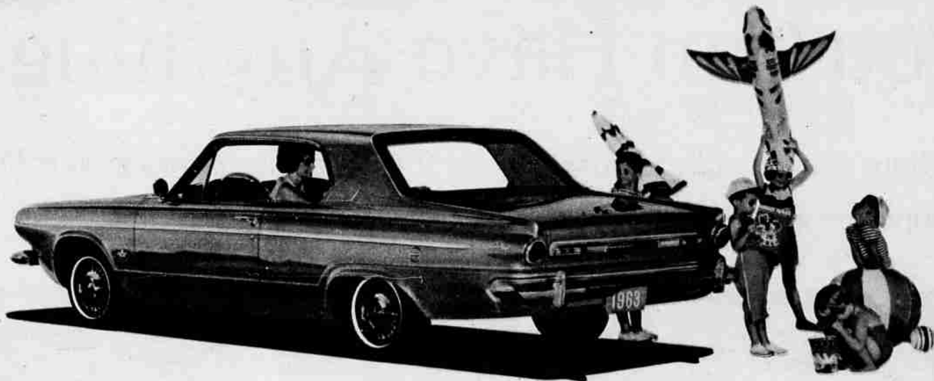
DODGE DART ALMOST EMPTY