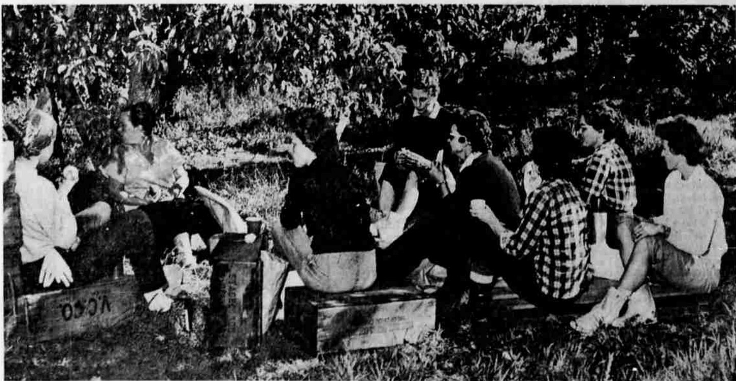
Every worker was more than ready for a rest and food when lunch time came Wednesday noon. The women prepared breakfast for their husbands and families and saw the children off for school before leaving for the orchard, and were home by late afternoon. Since the locker room project is going to take quite a bit of money, the women are looking around for more work and are offering to pick up bulbs in the gladiolus fields.