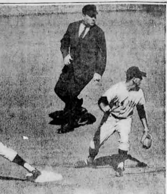
TWO-BASE ERROR —San Francisco Giants' pick off Alou off second in fourth inning of Monday's game. Alou scored on the error, and Willie Mays moved from first to third. The umpire is Jim Honochick. Giants won 5 to 2 to even the world series.