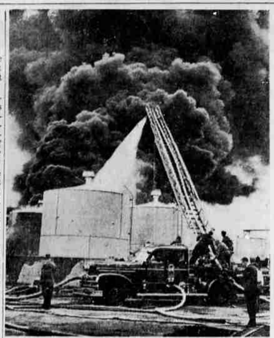
TANK BLAZES - Firemen pour water on a storage tank at the Acme Paint Co. in Detroit, Mich. The tank containing paint thinner exploded causing the fire, which was fought by 17 companies. No one was injured.

Other matters scheduled for consideration were final decisions on proposed legislation regulating retail installment financing and a bill which would prohibit debt-consolidating agencies in Oregon.