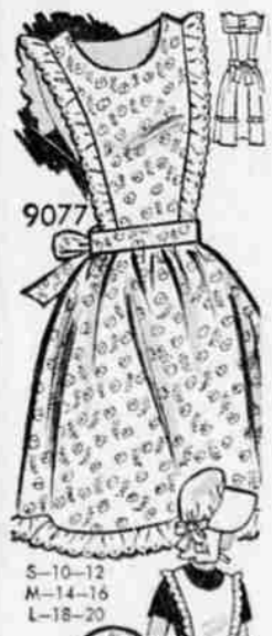
9077 S-10-12 M-14-16 L-18-20 by Marian Martin

Gay, new! Apron in two lengths—for chores or parties. Sunbonnet (adjustable head size) is ideal for garden or centennial celebrations. Printed Pattern 9077; Misses' Small Small (10, 12); Medium (14, 16); Large (18, 20). See pattern for yardages. THIRTY-FIVE CENTS in coin for this pattern—add 10 cents for each pattern for 1st-class mail. Send to Marian Martin, Medford Mail Tribune, Pattern Dept., 232 West 18th St., New York 11, N. Y. Print plainly NAME, ADDRESS with SIZE and STYLE NUMBER. FIRST TIME EVER! Glamorous movie star's wardrobe plus 119 exciting styles to see in our new Fall-Winter Pattern Catalog. Send 35c.