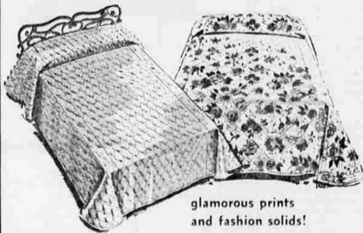
glamorous prints and fashion solids!

QUILTED-TO-THE-FLOOR SPREADS! SPECIAL BUY!