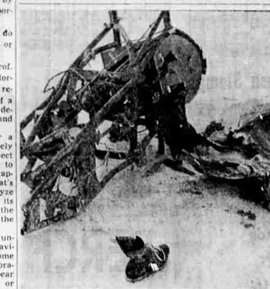
RACER KILLED - A shoe of driver Glenn Leasher lies on the salt bed in front of the seat in which he was strapped. Leasher was killed as his car disintegrated as it roared across the Bonneville Salt Flats in Utah.

blind persons, Kellogg found what he called remarkable ability to detect the size, distance and even texture of objects "by ear." The ability to distinguish different textures explains how a porpoise knows whether something in sonar range is a food fish or perhaps a plastic play bag or the hand of its keeper.