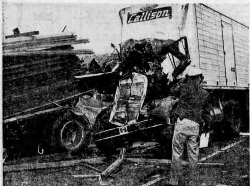
INSPECTS CRUSHED CAB —An unidentified state highway patrolman inspects crushed cab in which Mathew L. Roehrich, 36, of Eureka, Calif., was killed earlier this week. Roehrich's truck hit the rear of the slow-moving lumber truck in a rear-end collision that resulted in a massive traffic jam on US 101 at the height of the morning commuter rush.

head spawning area, empties above the proposed Nez Perce Mountain Sheep site.