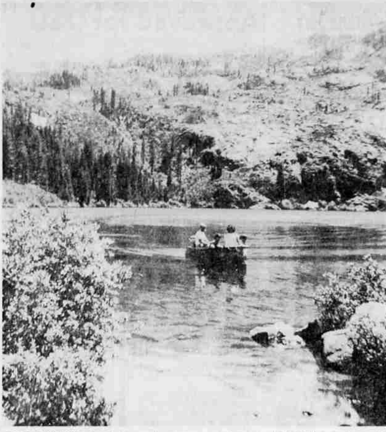
GOOD FISHING—For fishing, swimming, recreation area is located near the south boating and picnicking, many persons have found that Castle lake is an ideal spot. The lake used by the University of California to conduct experiments on the growth of fish, their longevity and trout production, as well as on the different plants in the water that the fish feed on and the chemical composition of the water.

Rogue River — Members of the Rogue River city council discussed what to do with city streets here recently at their August meeting. Present were council men George Magerle, Roy Strickland, Orvis Reeter and Arly Laws. The council first considered which type of paving would be best for the graveled streets in an attempt to reduce the amount needed each year to resurface and patch them. It was announced that the street committee would hold a special meeting next month to discuss such paving after bids had been received. Two porches at the city hall were recently completed — one joins the city hall and jail and the front porch was finished recently by Slim Burnett of Rogue River. Dan Perkey told the council that at least 100 feet of drainage tile was needed from the former Glen Nourse property on Depot st. south along the Southern Pacific tracks. It was noted also that a concrete lid has been made