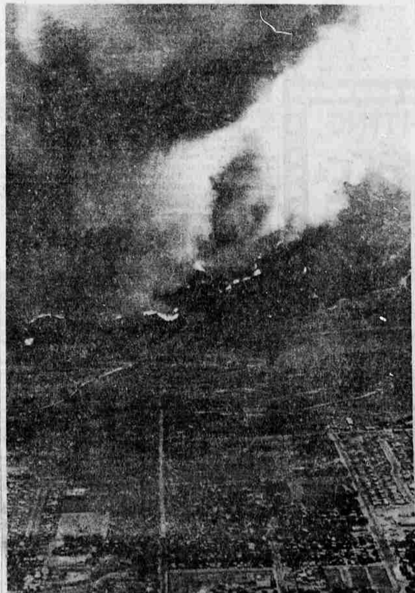
BURNS TOWARD TOWN — This aerial photo shows the town of Sylmar, Calif., as Tuesday. The fire so far has burned more than 5,000 acres north of here. an out-of-control brush fire burns toward

At one time the Eugene Big-Y was under the same ownership as the Medford Big-Y, the Oakdale market and the Eastside market.