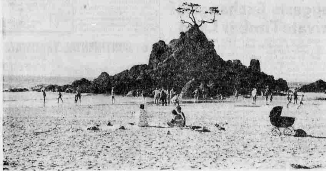
A solitary tree, topping a rocky dome, identifies Fogarty Creek State park 16 miles north of Newport.