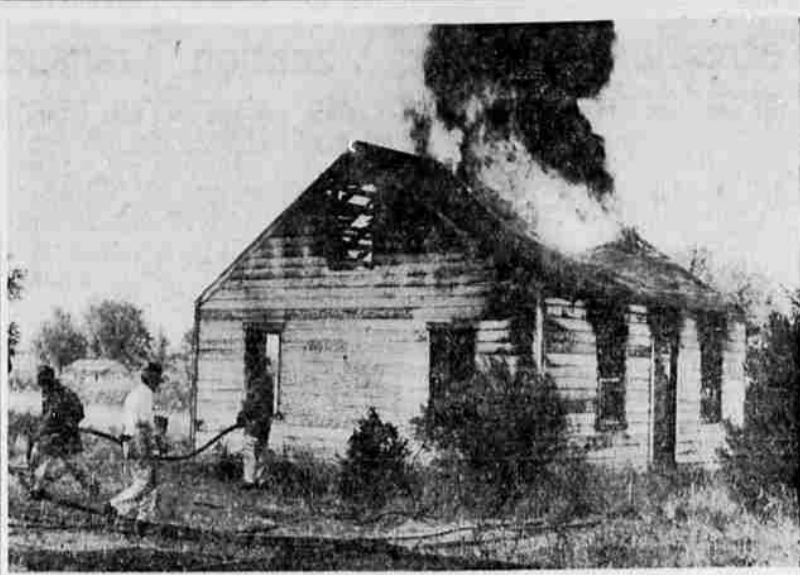
PRACTICE FIRE - Medford Fire department moved, served to train new firemen in the practiced fire extinguishing procedures on department. Removal of the structure was this house on Highland dr. recently. The house, necessary to facilitate the extension of Highway which was city owned and had to be re-land dr.

Largest mosses in the southern U.S. may reach four feet or more in length.