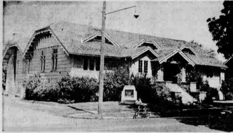
PURCHASE BUILDING - The Rogue Valley Girl Scout Council, Inc., are completing transactions regarding the purchase of the First Christian church building, Ninth and Oakdale ave. The Girl Scout organization is now making some repairs to the structure and other changes will be made in the future. The Girl Scout headquarters have been located at 500 East Main st. since 1927, but will move to new quarters soon after Sept. 1.