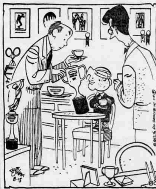
"IF YOU DIDN'T LIKE YOUR COCOA, WHY DIDN'T YOU TAKE IT BACK TO THE KITCHEN?"