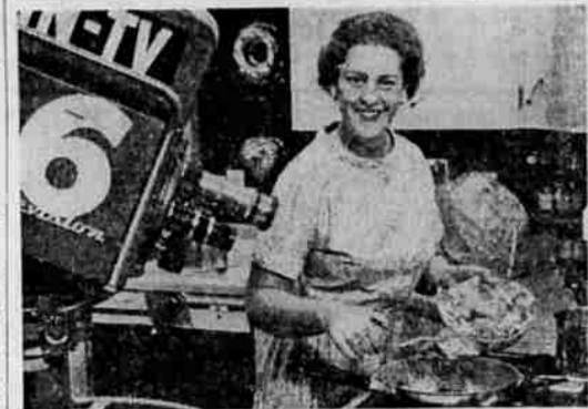
TV STAR SAYS OREGON FRYERS ARE TOPS

Six of the seven basic food groups require refrigeration to keep them in a safe and healthful condition.