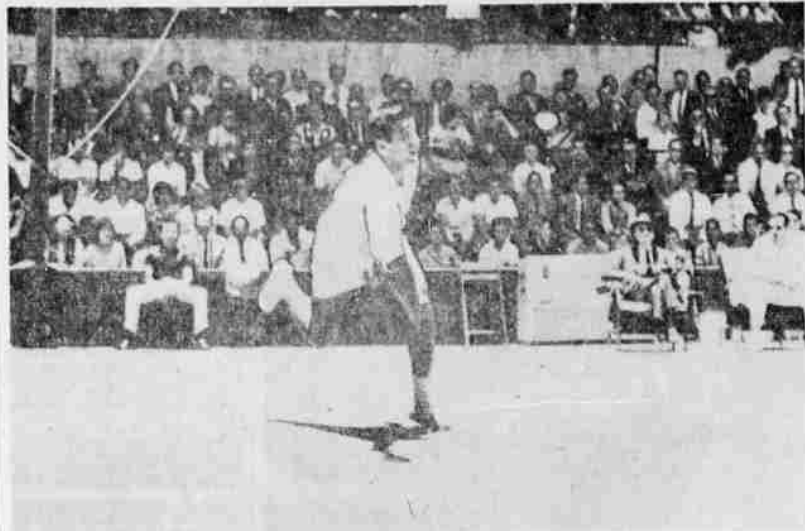
FOREHAND SMASH — Mexico's Rafael Osuna races to make forehand smash on ball seen in front of him at eye level during match with Jon Douglas in American zone Davis Cup tennis semi-finals at Mexico City Monday. Osuna took match in five sets, 9-7, 6-3, 6-8, 3-6, 6-1, to give Mexico the team victory. It was the first time Mexico has topped the United States in 16 attempts in various cup rounds since 1928 and put her in the American zone finals with Yugoslavia.