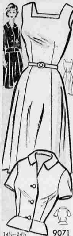
14 1/2-24 1/2 9071 by Marian Martin