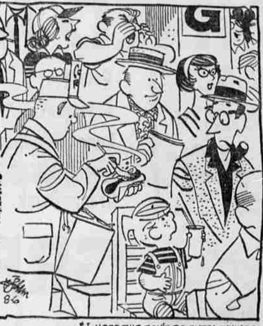
"I HOPE THIS DON'T GO EXTRA INNINGS. I'M LIABLE TO GET SICK!"