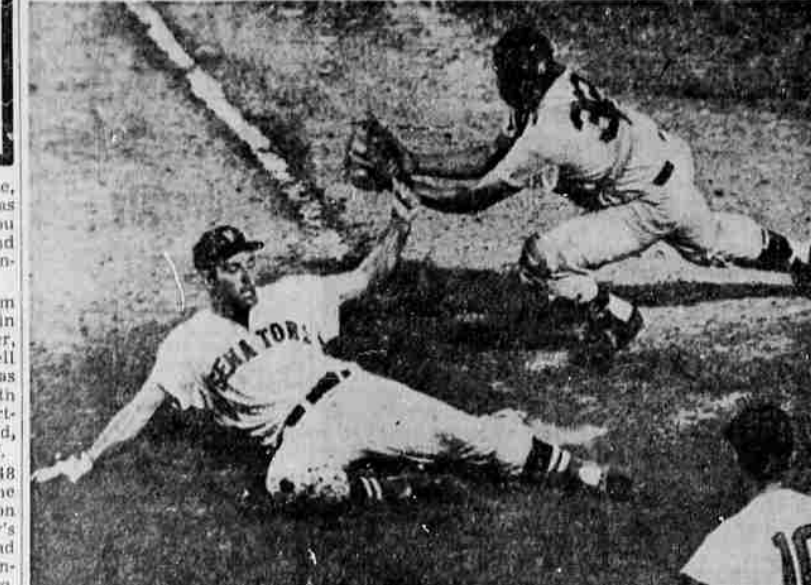
SLIDES SAFELY—Jim Piersall, Washington, D.C., on Tuesday. Catcher Elton Howard takes throw from third baseman Clevis Boyer on relay from outfielder Hector Lopez, too late to make the out. The Yanks won 9-5.